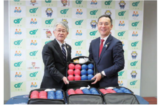
Presentation Ceremony of the official boccia balls

SEWT operates six plants in Thailand: four in Rayong and two in Ratchaburi and Kanchanaburi (hereinafter, R/K provinces) with a large number of foreigners working at the plants in these provinces. In fiscal 2017, it made improvements in the workplaces and employee dormitories in the R/K provinces, which included building rest areas in the plants, paving the road in front of the employee dormitories and installing a wall to protect employee privacy. Thailand has been strengthening regulations on the management of foreign workers through efforts such as legal amendments, and SEWT has been regarded as exemplary.