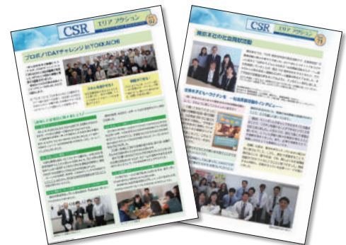
SWS Group newsletter

To celebrate the 100th anniversary of our founding in 2017, we held a free music concert by a violinist from Yokkaichi and local symphony orchestra in July. As a gesture of gratitude to the local community, as well as to promote regional arts and culture, we invited 1,700 residents to attend these events for free. We received many thanks from a lot of these people in the audiences.