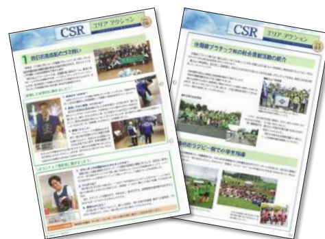
SWS Group newsletter

Every year the SWS Group reviews the social contribution initiatives of Group companies and recognizes affiliated companies for their exemplary social contribution activities by presenting awards at Group conferences. At these events, it gathers the supervisors of Group companies to encourage these efforts and promote their introduction to other Group companies. In the selection process, we review each activity in terms of its continuity and the level of contribution to the local community and select the activities that we feel merit the highest recognition. This fiscal year, the seventh year of the awards, we recognized the activities of the SWS Suwa Daiko Japanese Drum Team, which has been continuing their social contributions for about 47 years.