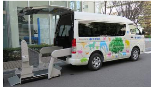
Loaned welfare vehicle